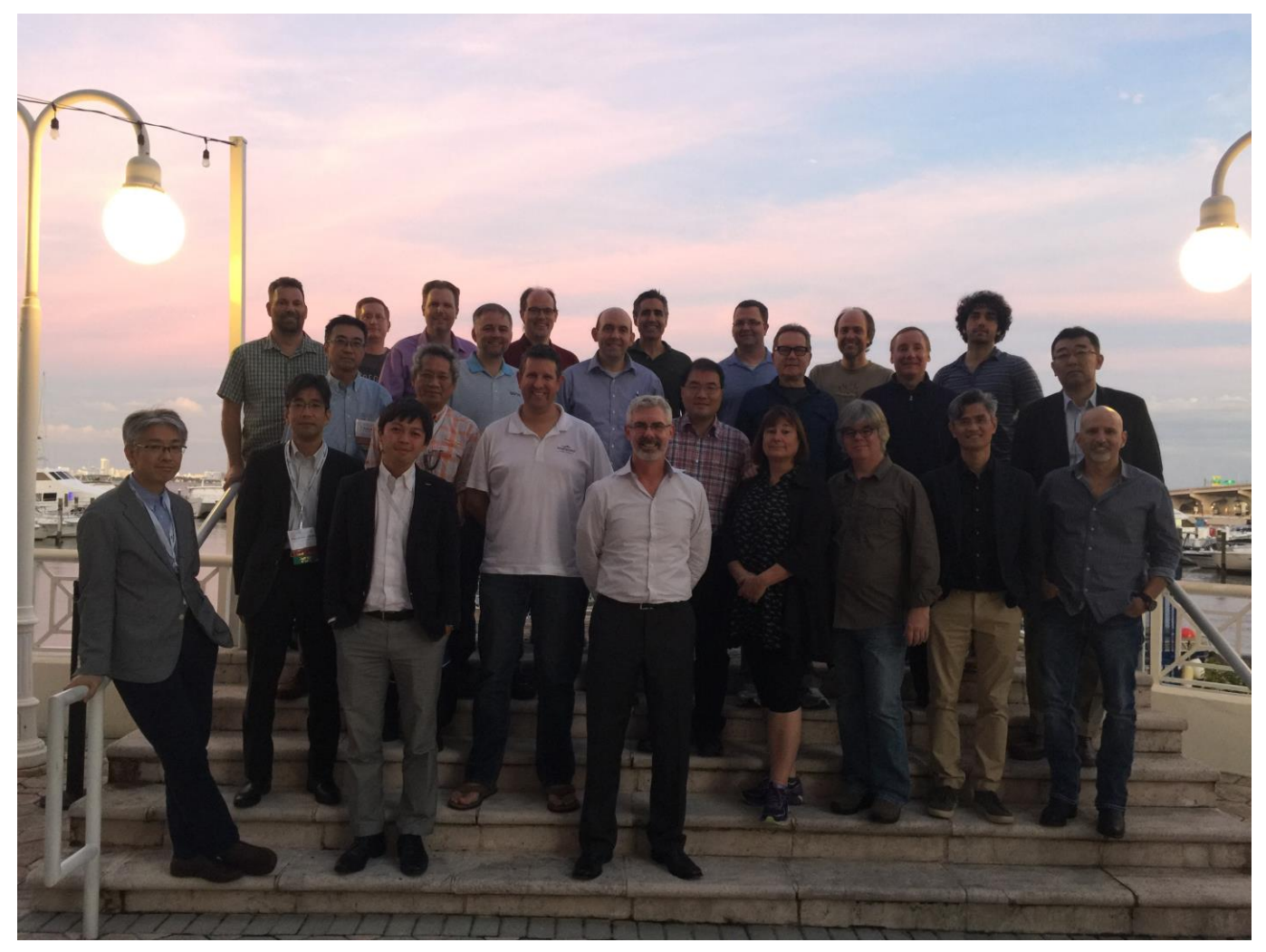
Figure 2: The sun sets (literally!) for CSICS 2017 in Miami as several TPC and Excom members enjoy an informal gathering after the conference.